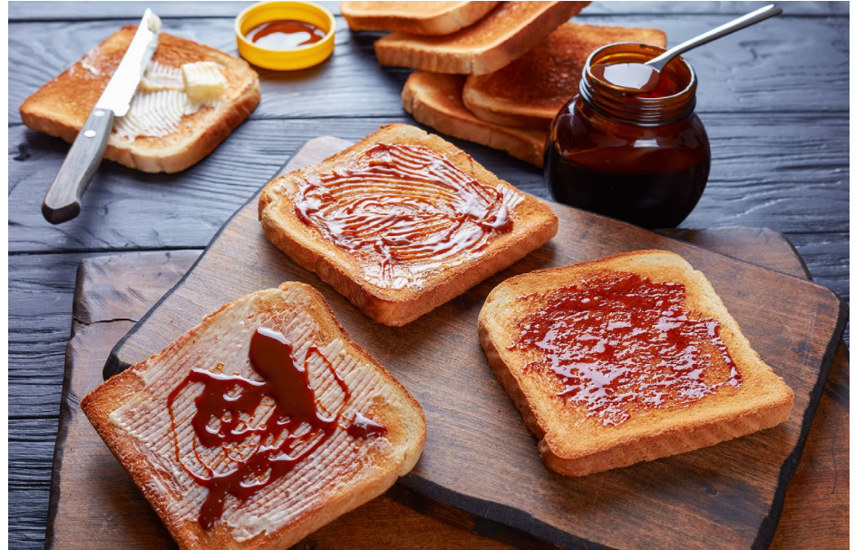
Marmite issue: shortages in yeast from breweries, coupled with rising demand, has led to empty shelves.

Q1 company earnings calls were dominated by both optimistic management outlooks on sales recovery, but also cautionary warnings around rising