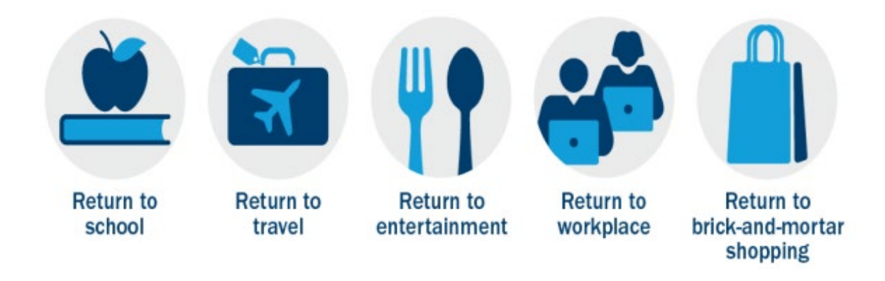
Figure 2: Tracking inputs

Our index suggests we are still 24% below pre-Covid activity levels. The levels of component activity vary: the return to brick-and-mortar stores is 17% below its pre-Covid level and a normal work routine is 20% below. The subcomponent with the lowest level is travel/entertainment: 36% below pre-Covid levels.