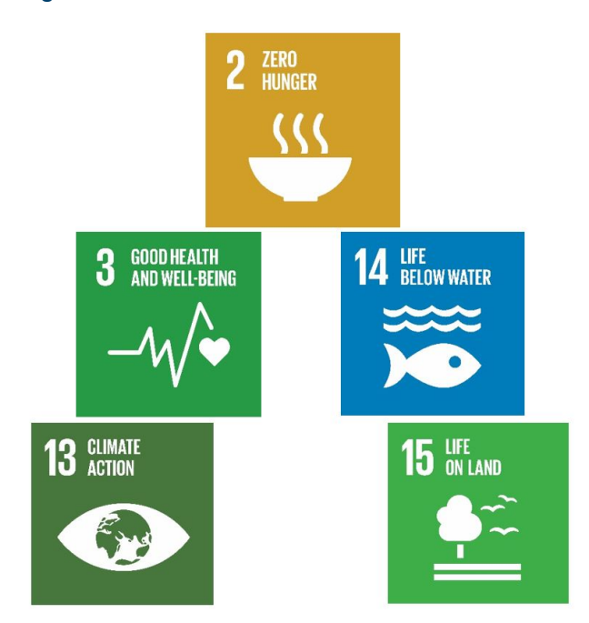
Figure 1: Food-related UN SDGs